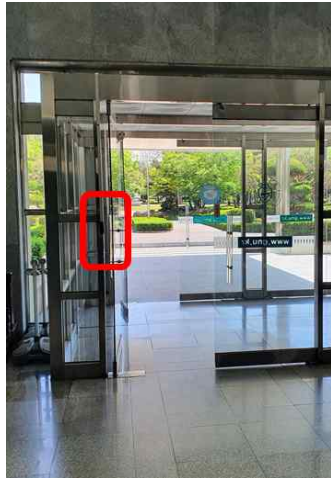
① Detailed location of the "Press" button next to the inside door for opening