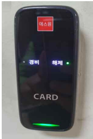
<A picture of the Card Reader Details>