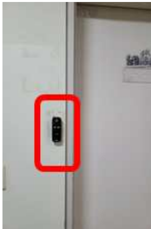
<A picture of the Card Reader>