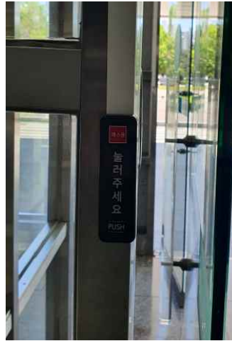
② Opening button of the inside door